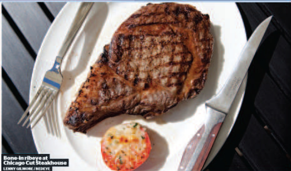
Bone-in ribeye at Chicago Cut Steakhouse

Dry-aged: Meat is hung in a cooler to evaporate moisture from the muscle and concentrate flavor.