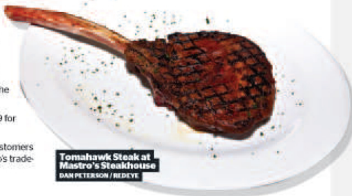
Tomahawk Steak at Mastro's Steakhouse